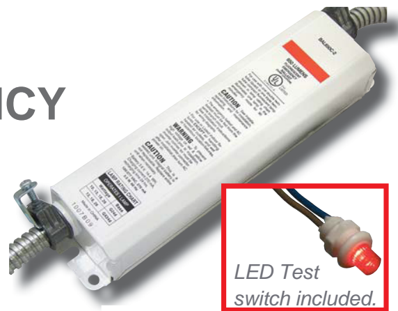
LED Test switch included.