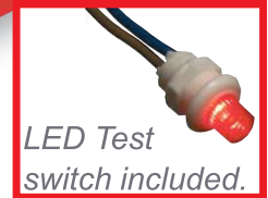
LED Test switch included.