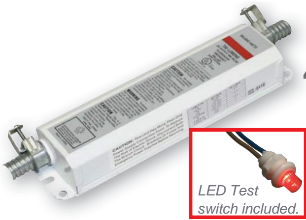
LED Test switch included.