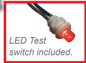
LED Test switch included.